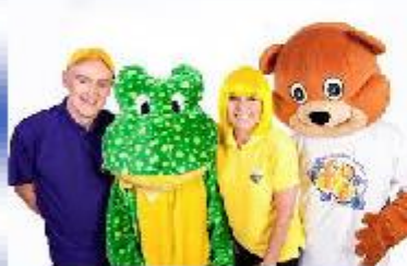
The Fabulous Lemon Drops