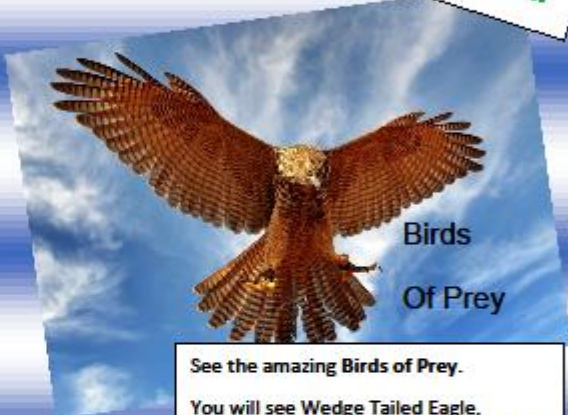
Birds Of Prey